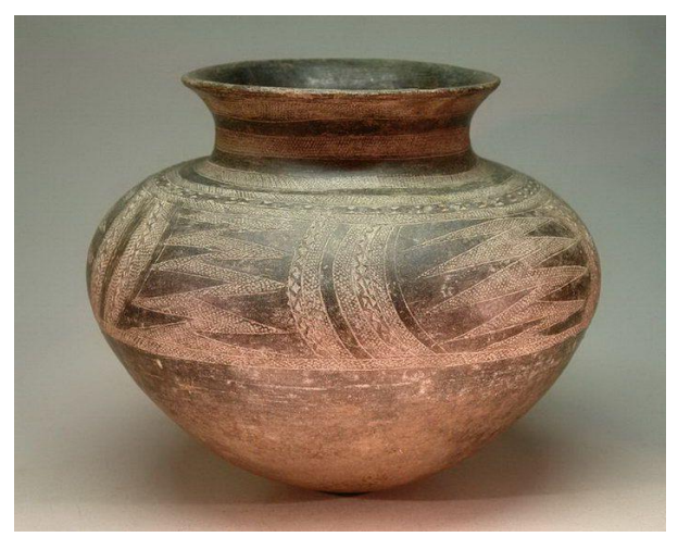
Makonde Grain Storage Pot

African pottery traces the very thread of existence of Africa's inhabitants.