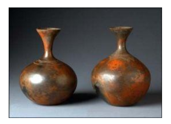
Tutsi water pots, Rwanda

Fresh clay is dug from the pits with short, handled hoes or digging sticks and is carried in baskets to the potter's compound, where it is left in piles to dry. It is then broken up, usually by pounding in wooden mortars, and any stones or other foreign matter are picked out by hand. The clay is broken up into small chunks so that it will absorb water, or "slake" more rapidly and more evenly. The clay is then placed in large earthenware pots, mixed with water, and left for several days to soak.