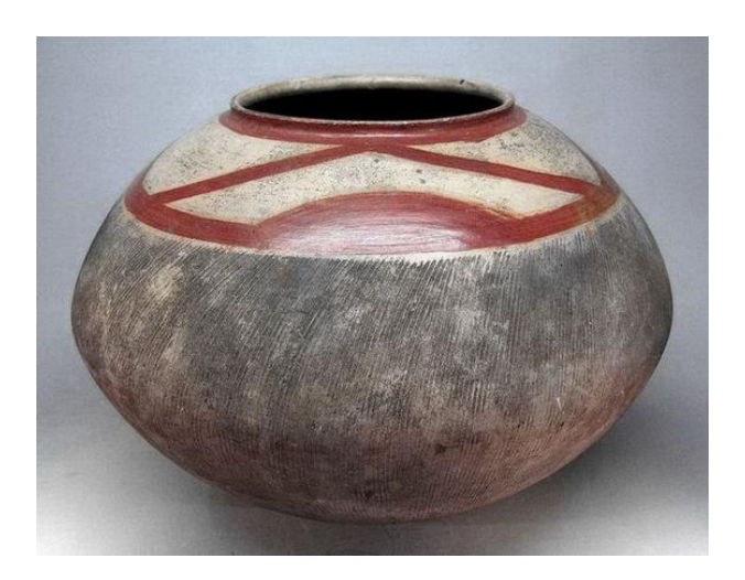
Tanzania/Zambia Nyakusa Grain/Water Pot.

To make a pot a few things are needed, clay, a temper, skill, and last but not least the fire. The Ovambo, Kavango and Caprivi tribes in Namibia, use the hardened clay from termite hills, as it contains the glue saliva from the termites. This termite clay help make the pots quite robust and lend support to the binding of the clay in forming the pot.