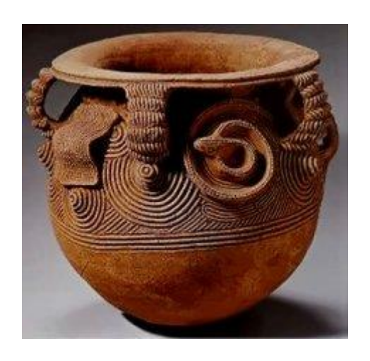
Decorated global vessel, everted lip, Igbo

Other parts of ancient Africa used plant dyes like red ochre or charcoal to paint on pottery. The figures painted on ancient African pottery were abstract forms of human and animal forms. There are also examples of zig-zag lines and other geometric designs painted on ancient African pottery. Another way ancient African pottery was decorated was with gemstones, ivory and leather. (7)